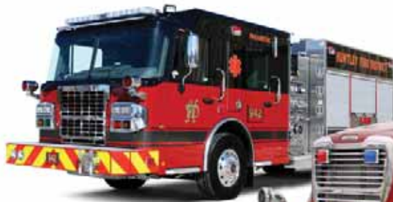
PUMPER • HUNTLEY, IL