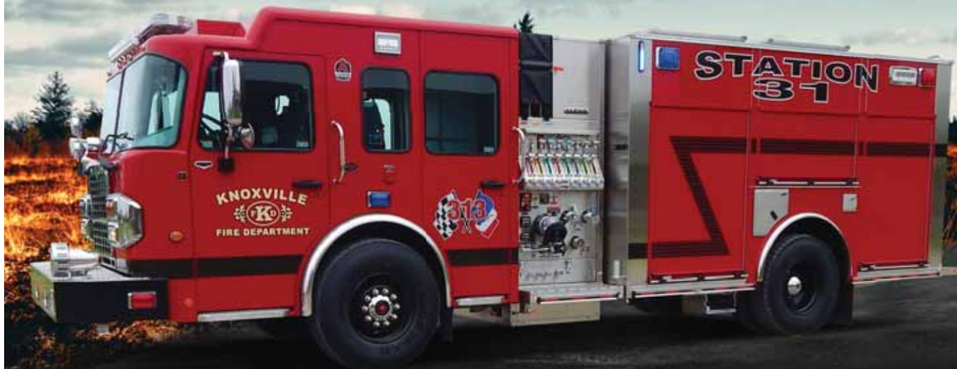
CUSTOM SIDE CONTROL PUMPER KNOXVILLE FIRE DEPARTMENT / KNOXVILLE, IA