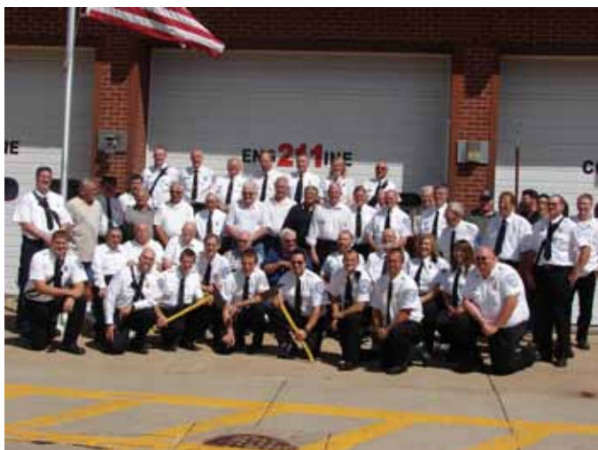
125th Anniversary Active & Retired Firefighters