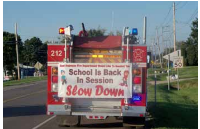
Above: First Day of School Below: Joint Training