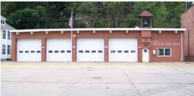
Above: Station #1