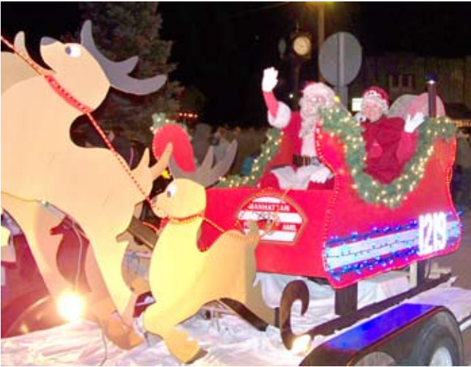
Manhattan Parade Float