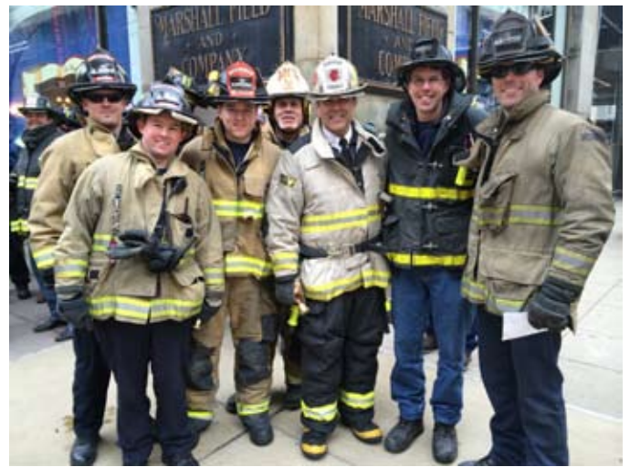
Paxton Christmas Caroling