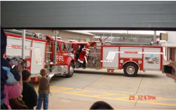
East Dubuque Santa Dispatch

There are so many ways that IFA fire departments celebrate Christmas amongst themselves and within their communities. Decorating the station and rigs, leading the town parade, Christmas caroling, family and community Christmas parties, seasonal fire safety presentations, fund-raising and gift-giving to families in need, “keep the wreath red” campaigns, and the list goes on... However it is that your fire department celebrates, I know that it is just an extension of the Christmas spirit that inspires you all year round – the spirit of giving, the spirit of being there for people in need, the spirit of self-sacrifice, the spirit of celebration in the goodness of God.