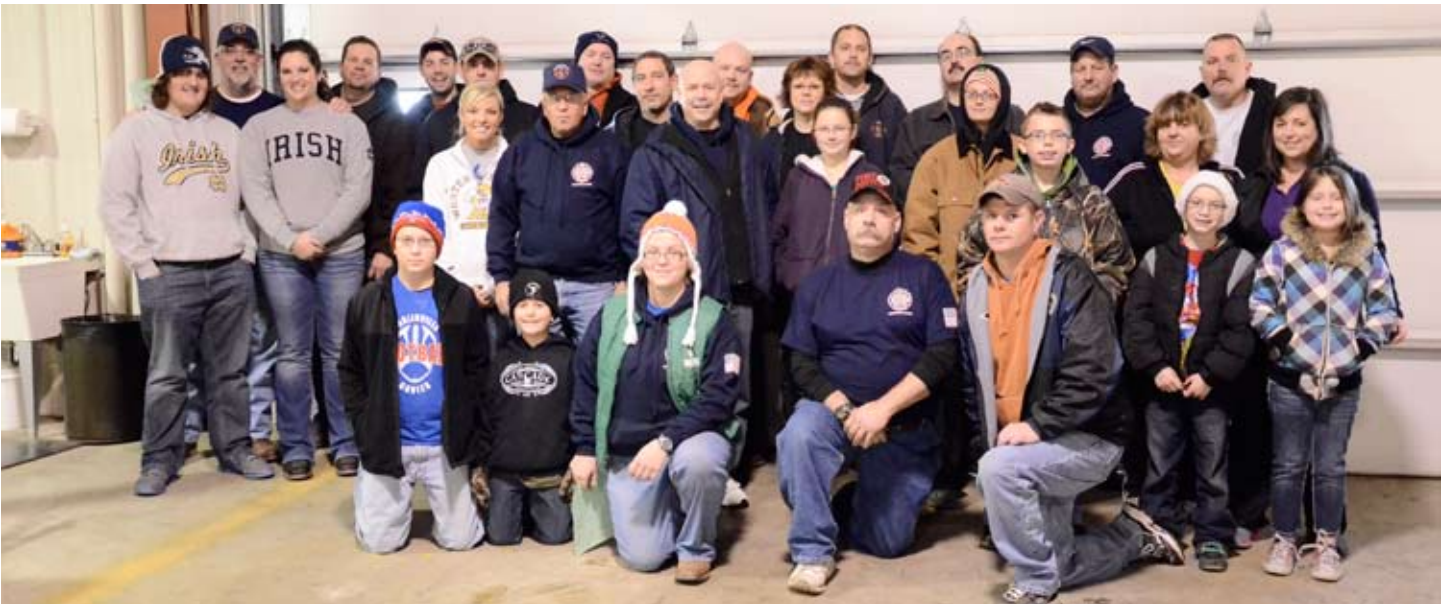
Carlinville - Help the Elf Group