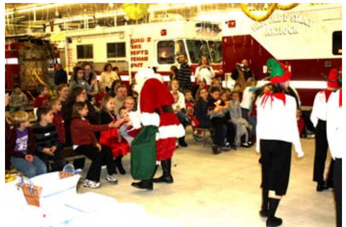
Antioch Gift Giving