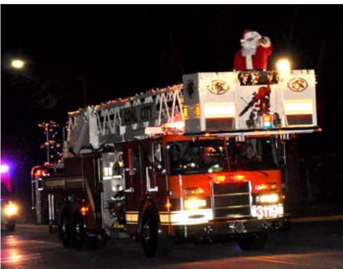
Coal City Santa Sleigh