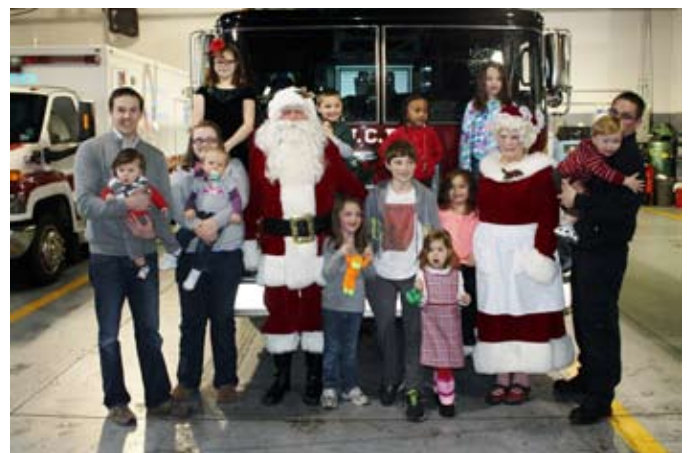
South Chicago Celebrates