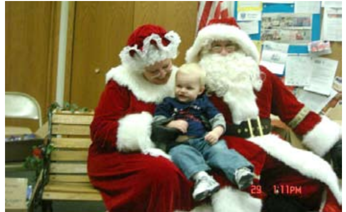
Mr. & Mrs. Claus