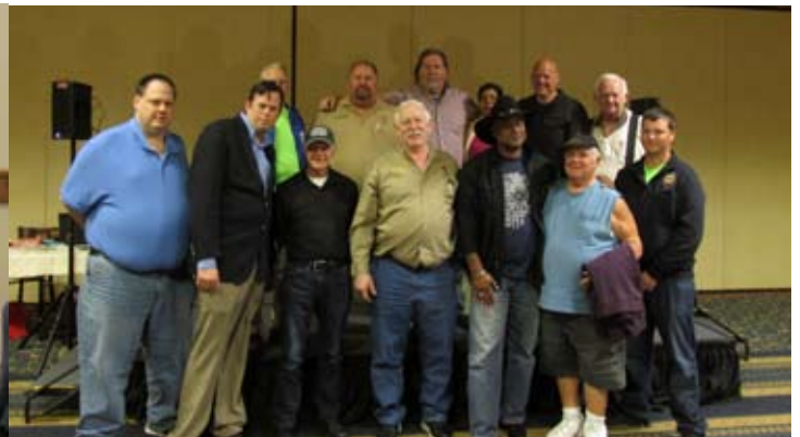
IFA provided entertainment on Saturday night. The board of directors are pictured with the comedians that provided the entertainment for the evening.