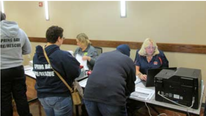
IFSI manned the registration desk

The 2019 Conference is slated for October 24 - 27, 2019. The IFA board has already began planning for the 2019 conference. Stay tuned for more information.