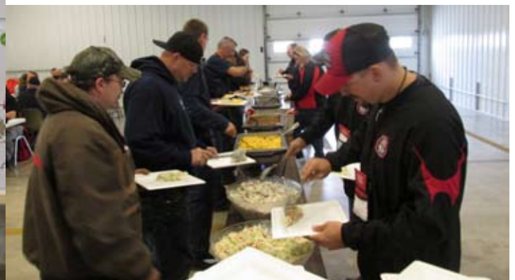
IFA provided lunch on Friday and Saturday