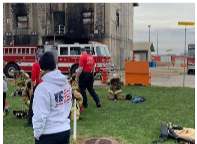
Provided a number of hands-on classes at a very reduced cost.