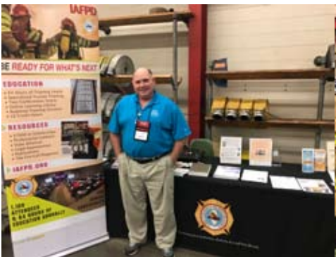
Illinois Association of Fire Prot Dist.