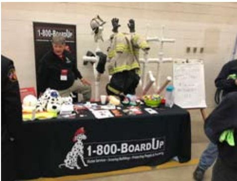
1-800-BoardUp (Werner Restoration)