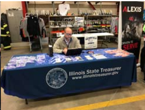
Illinois State Treasurer