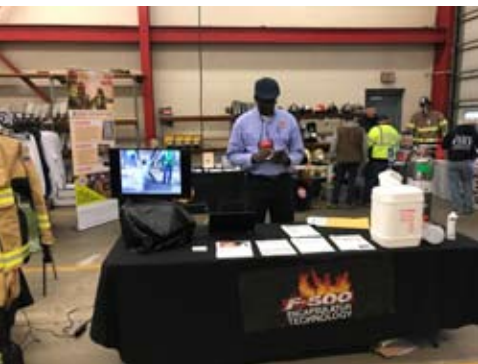
Hazard Control Technologies