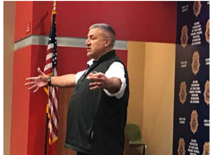
Updates from the Office of the State Fire Marshal and the Illinois Fire Service Institute at Annual Meeting