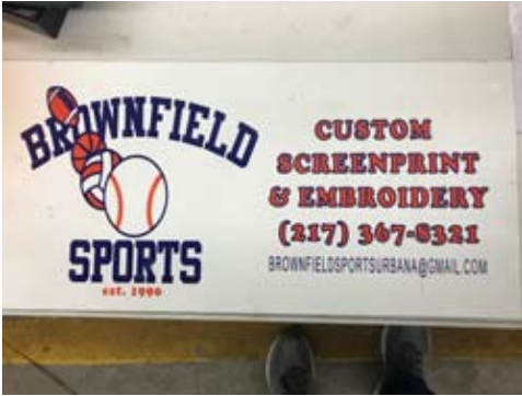
Brownfield Sports (IFSI Apparel Sales)