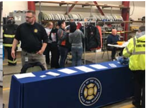
Office of the State Fire Marshal