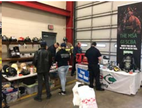
Municipal Emergency Services