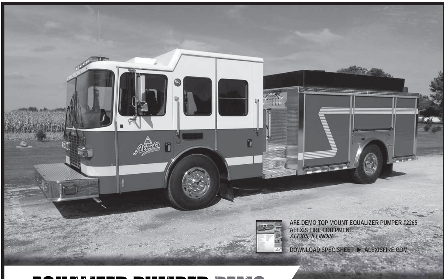
AFE DEMO TOP MOUNT EQUALIZER PUMPER #2265 ALEXIS FIRE EQUIPMENT ALEXIS, ILLINOIS DOWNLOAD SPEC SHEET ► ALEXISFIRE.COM