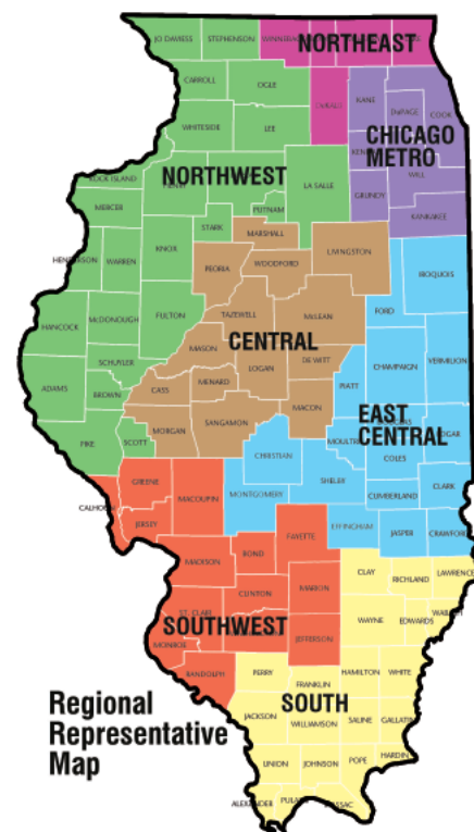
Regional Representative Map

The Illinois Fire Service Institute Regional Representative are the important link to bringing State Fire Academy training to your Fire Department.